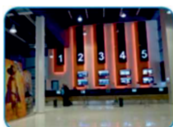
IMAX Cinema, Ufa