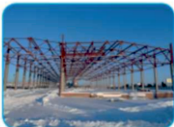
South Uralsk, Trading Company "Uzhnyi"