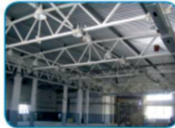
Chelyabinsk, Newspaper factory