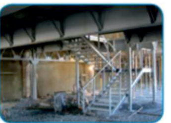
Chelyabinsk, Furniture Factory BERLONI