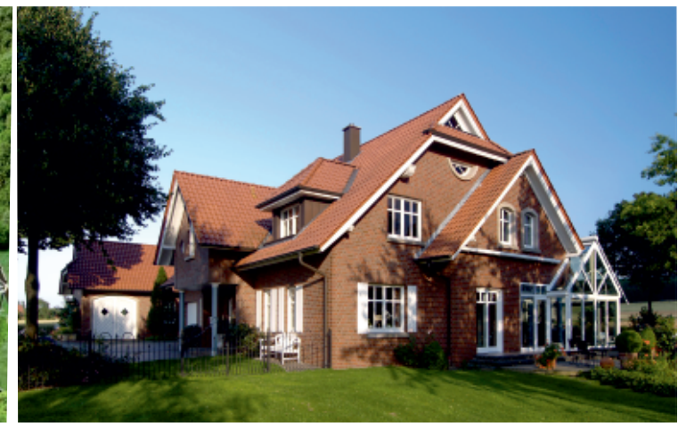
PRIVATE HOUSE BUILDING

Kazan City, Fuchika str. 90a, room 502 +7 843 253-44-46