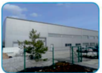
Chelyabinsk, Hydraulic Center HYDAC