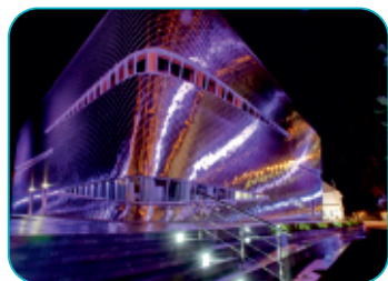
Khanty-Mansiysk, Chess Palace