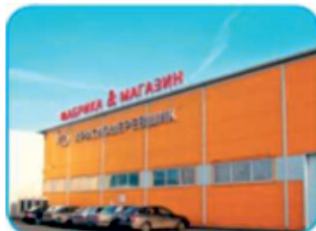
Chelyabinsk, warehouse "Krasnoderevshik"