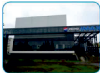
IMAX Cinema, Ufa