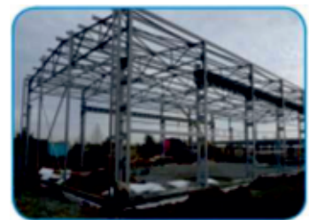
Chelyabinsk, Hydraulic Center HYDAC